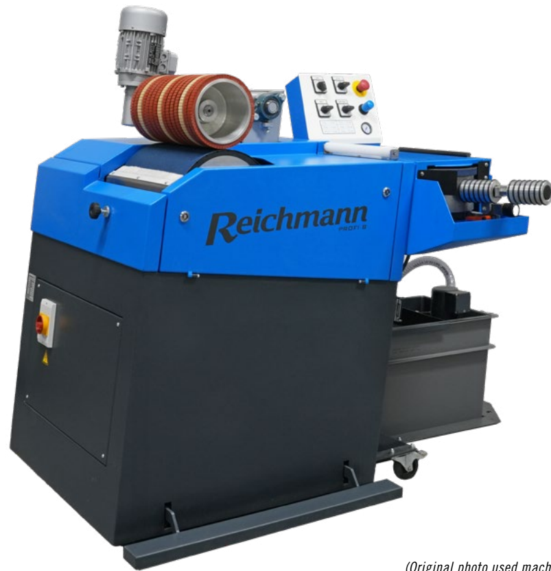
(Original photo used machine)